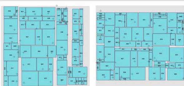
Cutset Optimization 8 wafers needed

For more information on products or services please visit www.xyalis.com or e-mail sales@xyalis.com